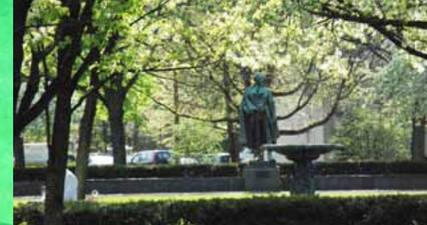
ACADEMY GREEN PARK