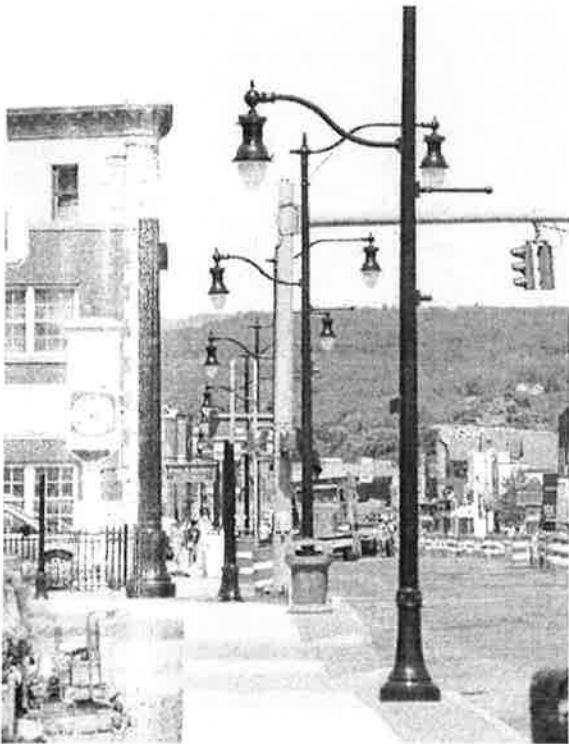
Fixing the roadway on Broadway in Kingston.

A mechanic at the J&H Tire and Auto Center on Cornell Street goes down the list of bad outcomes a driver can expect after hitting a pothole at high speed.