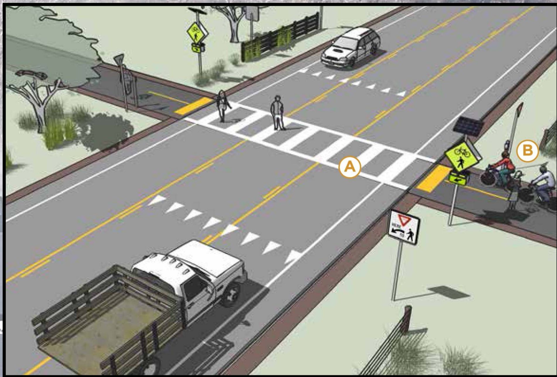
RECTANGULAR RAPID FLASHING BEACON (RRFB)