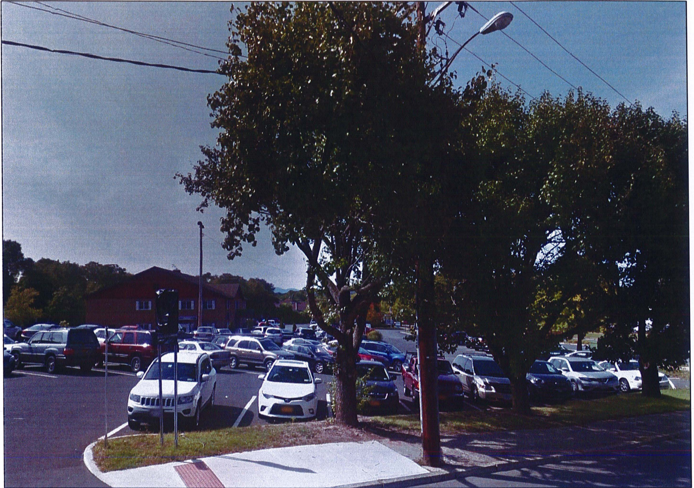
Street Trees on the site.