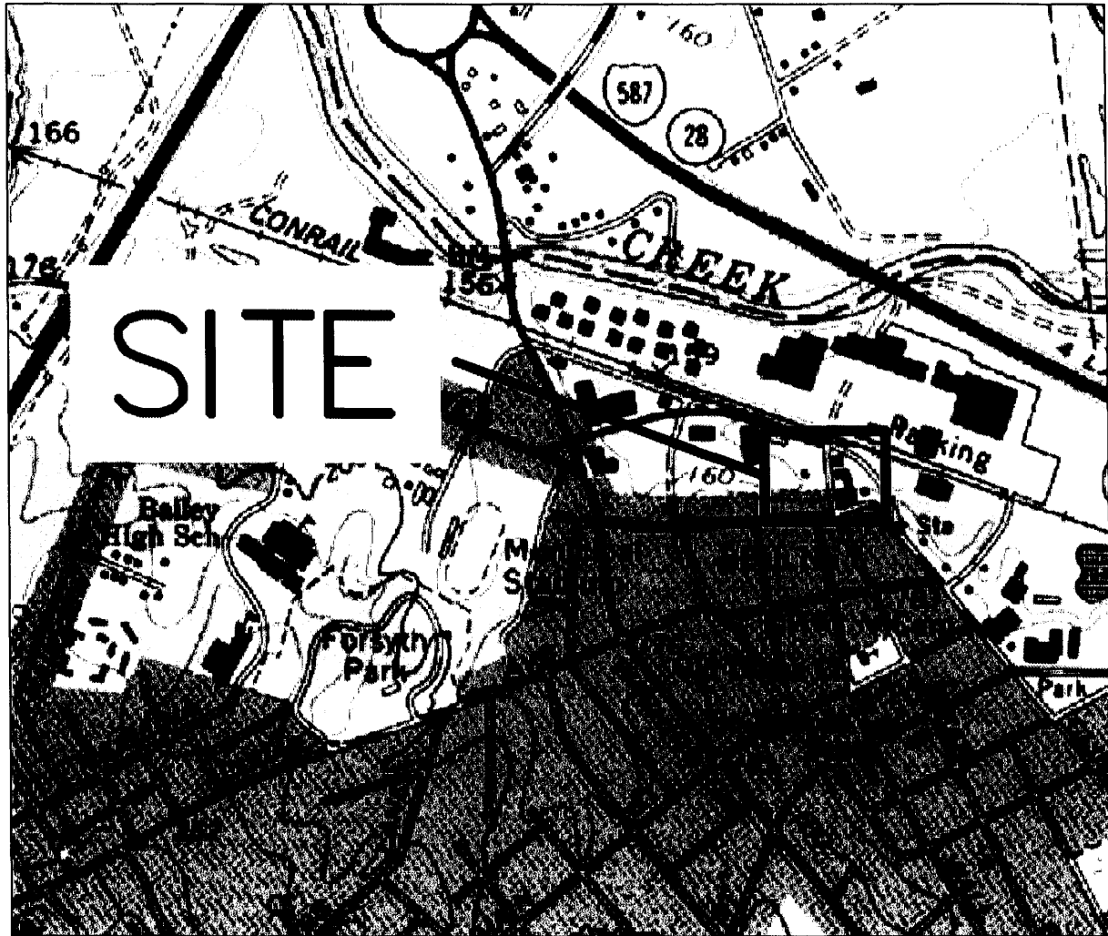
Figure 1 Location Map