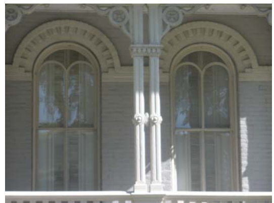
Porch and window details at 18-24 Stuyvesant

recently, fancy ironwork decorated the crest of the cupola and main roof.