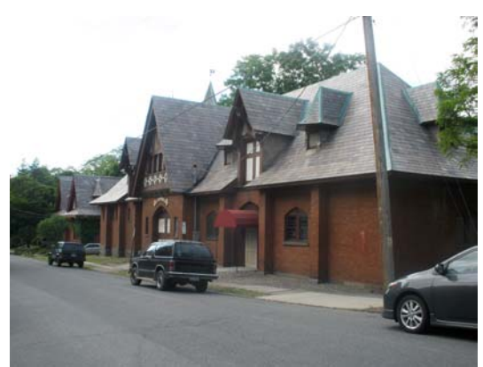
The Coykendall carriage houses on Augusta Street

Augusta Street Carriage Houses. The rustically picturesque carriage houses at 12 and 20-22 Augusta Street once stored the carriages and horses and later the family automobiles for the Coykendalls. The chief caretaker and chauffeur lived in the house at number 20. The family monogram can be seen in the copper weathervane at 12. At 20-22, a pivoting turntable facilitated parking. A local resident remembers a Mercedes-Benz, a Cadillac, and a Pierce-Arrow.