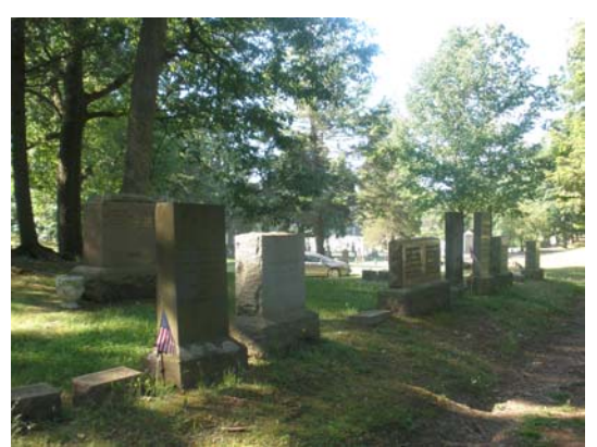
The McEntee family plot in Montrepose

Montrepose Cemetery. If you walk back now to Montrepose and then one block north, you'll see the entrance to the cemetery where most of the early residents of the West Chestnut Street neighborhood are buried. The cemetery is an outstanding example of the 19<sup>th</sup> century cultivatedly natural landscape made popular by Andrew Jackson Downing. The cemetery was formed in 1850 by Rondout's leading citizens. Thomas Chambers, one of Kingston's early settlers (1652), has been reburied not far from the entrance on the right. The Coykendall family members are buried near a wooden pergola atop a large central knoll. William Brown, John D. Schoonmaker's African-American chauffeur, shares a place in the family plot. Calvert Vaux is buried among the McEntees.