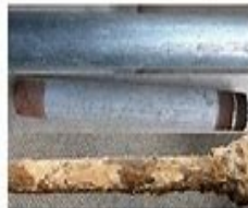
Galvanized pipes are dull gray and a strong magnet will stick to the pipe. Top to bottom: new, aged, removed from the ground.